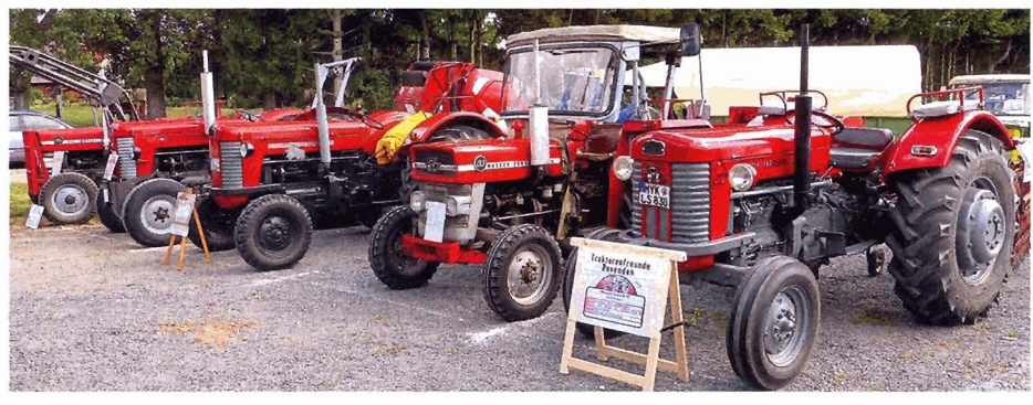
A line up of red starting with an MF 65, note the lighting equipment including direction indicators are quite different on German tractors compared to tractors for the UK market.

In Germany it is quite rare to see tractors being displayed from outside manufacturers as you do in the UK; club member and collector Uwe Schatz