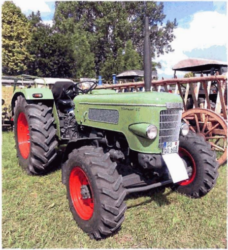
A rare Fendt Farmer 3S four-wheel drive.