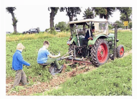
In the working area was another tractor name under the AGCO banner. Pupils from a Bovenden School had worked on a potato project and demonstrated what they had learned about this very important vegetable crop, its growing and cultivation. Here mechanical weeding of the potato rows with a Fendt as the power horse.