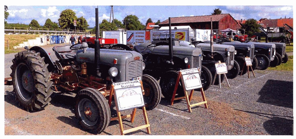
They are all named Ferguson, starting with TEF far right up to the FE 35 "Golden Belly" on the left.